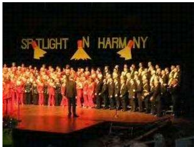
Massed choruses, Garden City Chorus, Harmony River Chorus, Atlanta Vocal Project and Song of Atlanta Show Chorus prepare to sing the 8-part finales, "Anything You Can Do, I Can do Better" and "In Harmony"

After the last chord rang out and the curtains closed on the evening performance, there was a lot of polecat and tag singing backstage. As usual, even after an exhausting day of performing two shows, we just can't stop singing. All agreed it was an event that will live in our hearts and minds, as was sung in "The Whiffenpoof Song," "...while life and voice shall last."