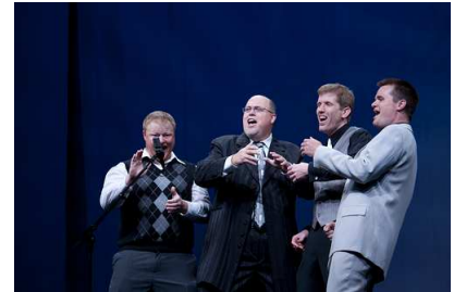
"The Real McCoy"