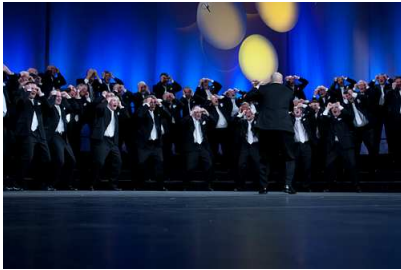
"Music City Chorus"