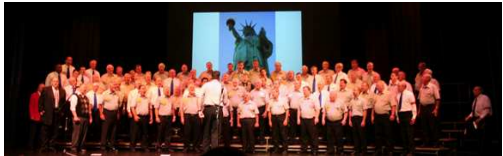
Choo Choo Chorus and Confederate Harmony Brigade singing America the Beautiful