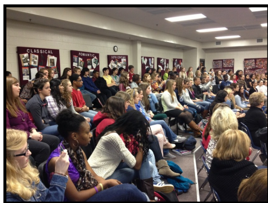
Interested students at Brookwood High School