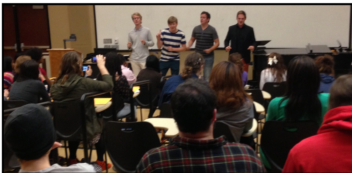
Ringmasters at Georgia State University