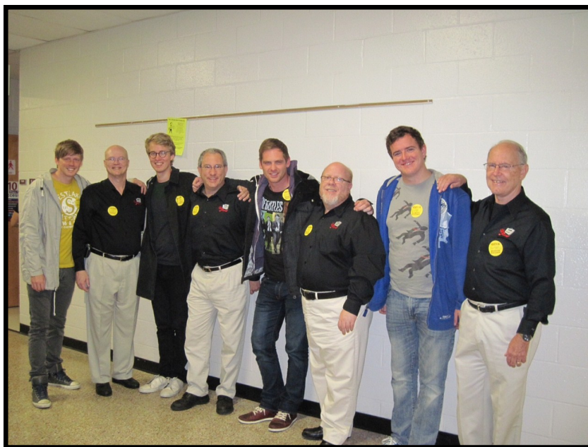
Ringmasters and Up Front at Brookwood High School