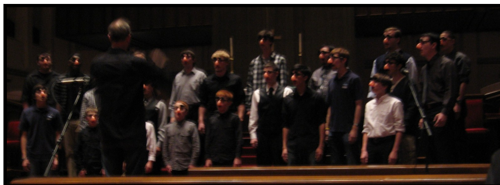
Georgia Spirit performs "I Got Rhythm" at the Ringmasters Show