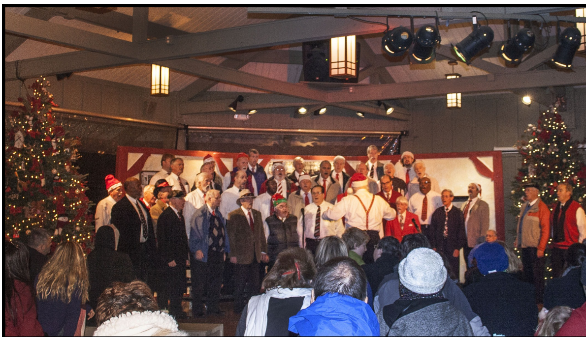
Singing at Rock City