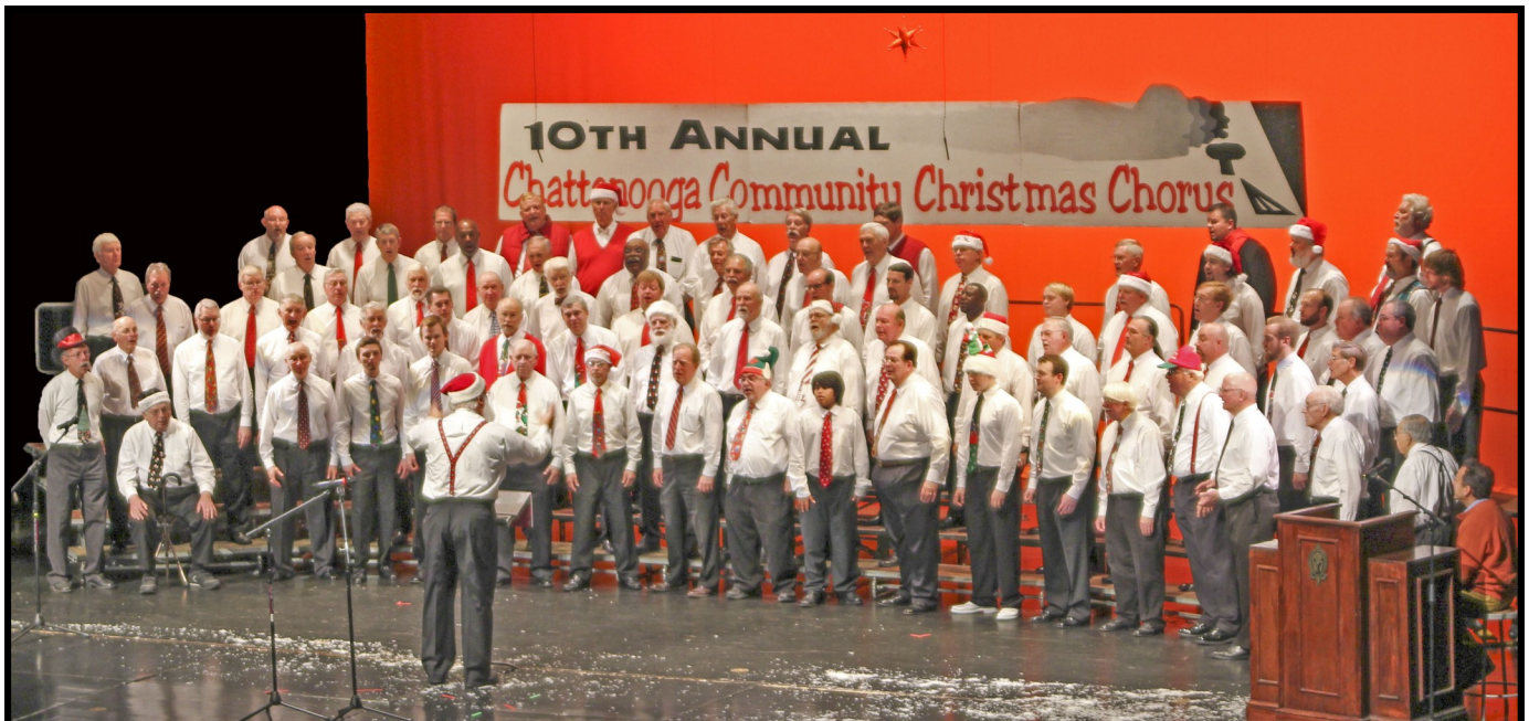
Chattanooga Community Christmas Chorus

With this being our 50th year and also the 10th annual CCCC, the chapter set a goal of raising $10,000 for a local charity, the Walter Boehm Birth Defects Center. The goal almost doubled what was raised in 2011. When the expenses were paid and the ticket and donation money counted, we presented the Boehm people with a check for $11,115, a sum that amazed everyone. This year we had the largest CCCC with 80 men on stage, the largest audience, and the largest donation to charity in our 50 year history. What a way to celebrate our golden anniversary!