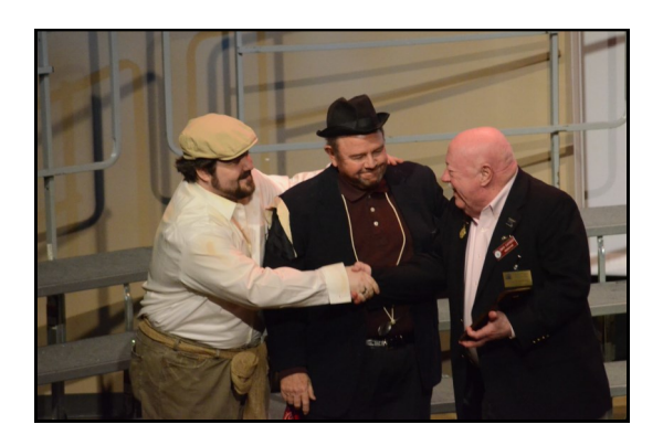
MEMPHIS MEN OF HARMONY Most Improved Chorus