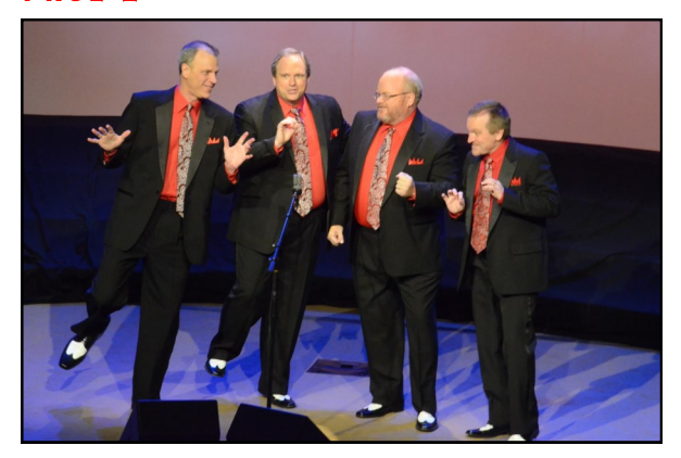
A MIGHTY WIND International Qualifier