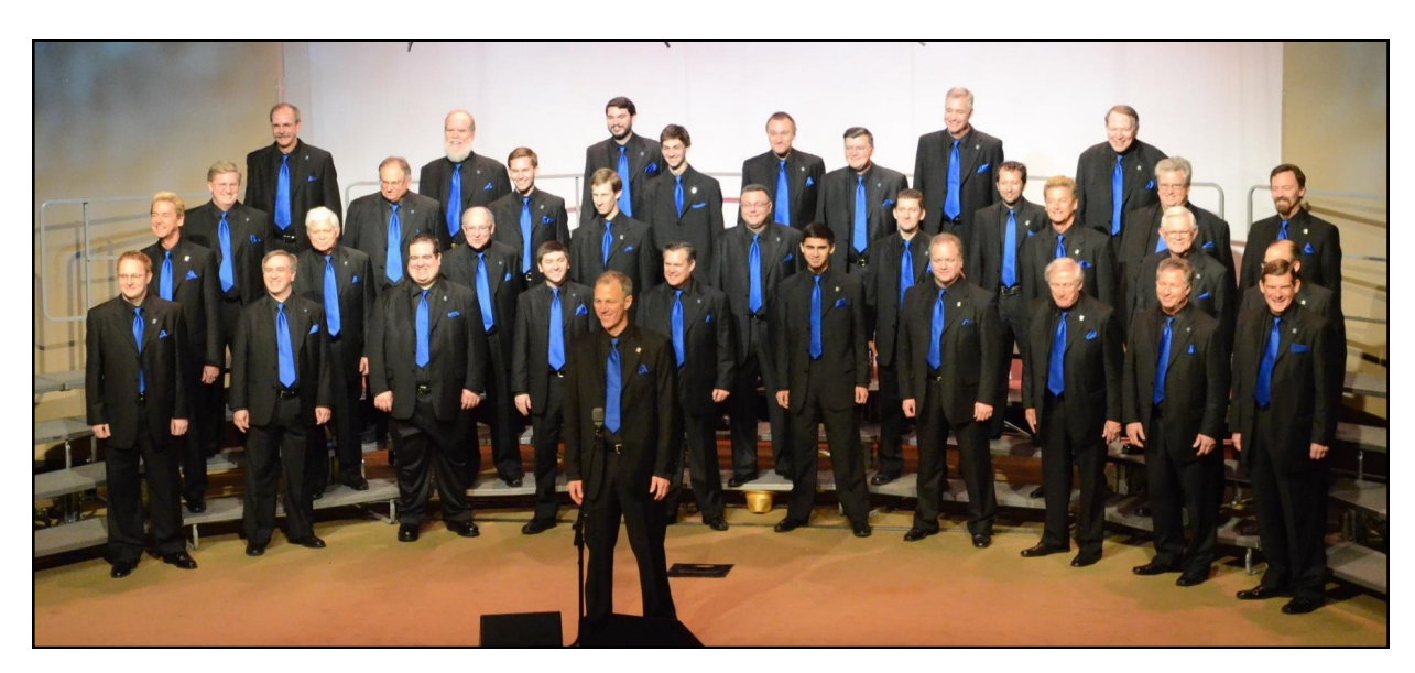
ATLANTA VOCAL PROJECT—District Chorus Champion