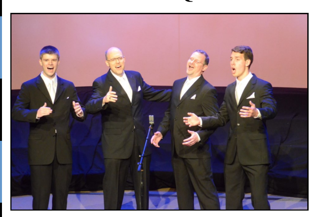
MC4 International Qualifier