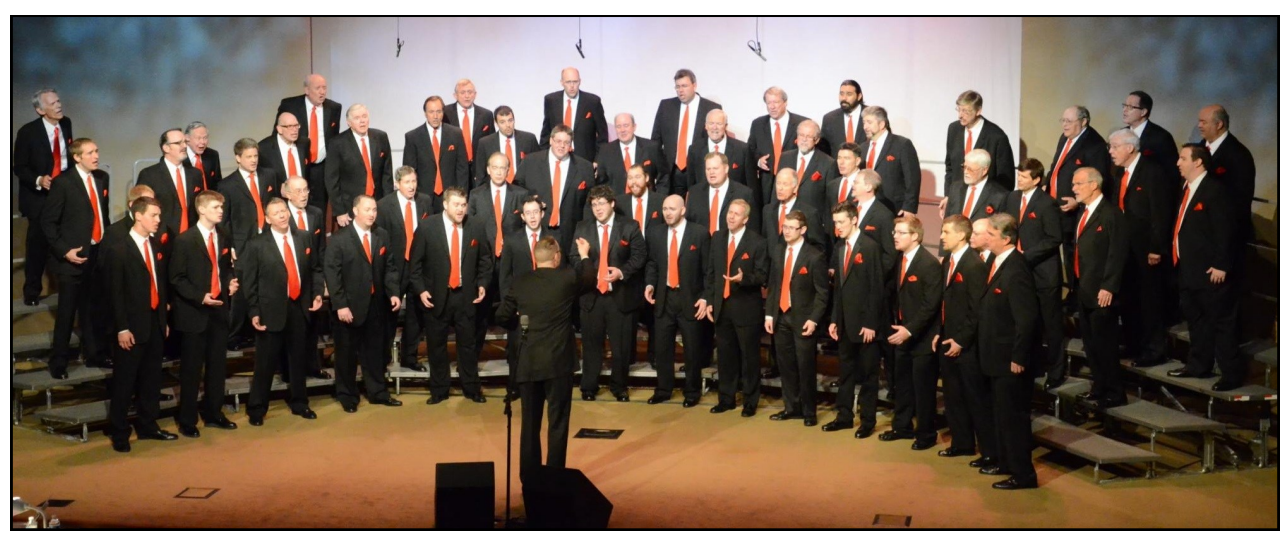
MUSIC CITY CHORUS—Las Vegas Bound