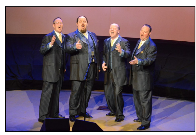
TNS International Qualifier