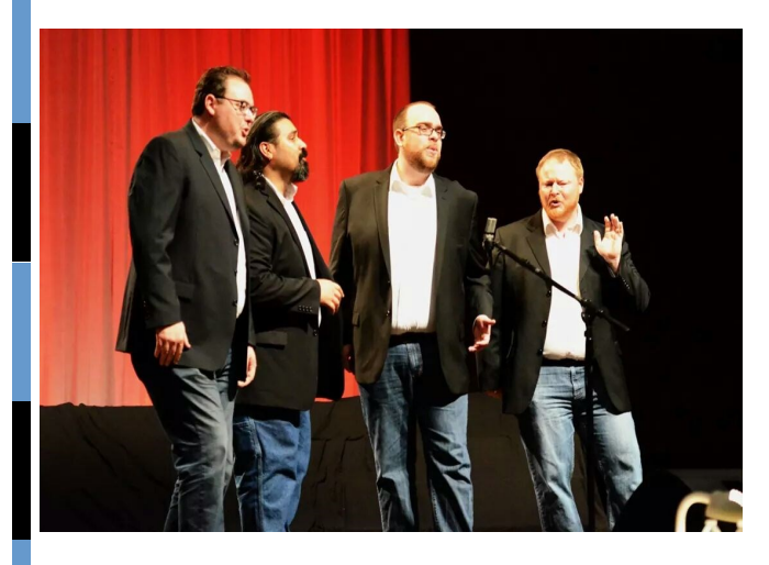
Phat Chords (Mic Testers)