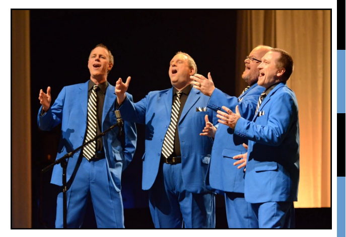
A Mighty Wind

Music City Chorus, District Chorus Champs