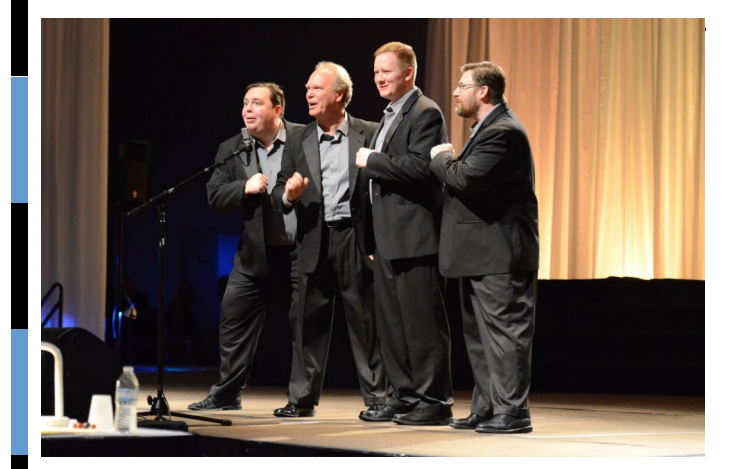
Steel City Four