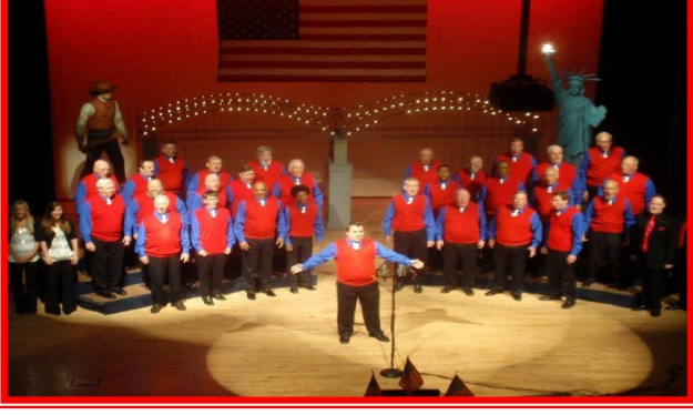
The Memphis Men of Harmony Chorus

Enjoy a fun-filled night of barbershop harmony and test your trivia knowledge too!