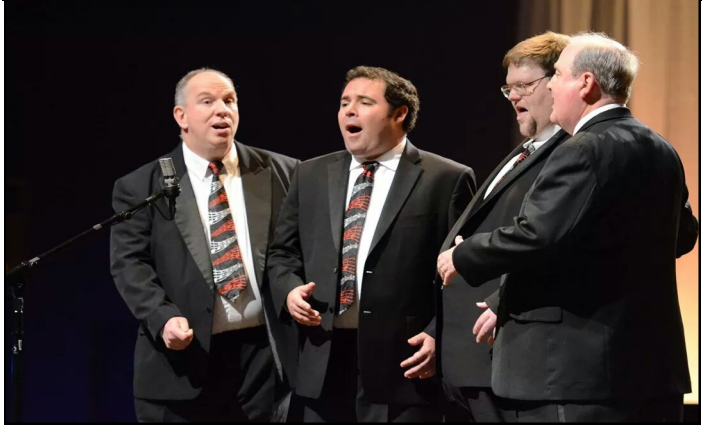
Debut (Evaluation Only)