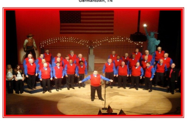
The Memphis Men of Harmony Chorus

Enjoy a fun-filled night of barbershop harmony and test your trivia knowledge too!