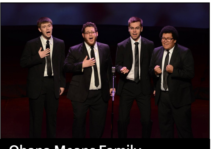
Ohana Means Family (Youth Quartet)