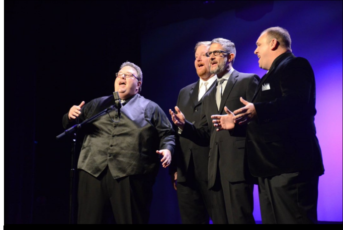
Glen Arven Avenue