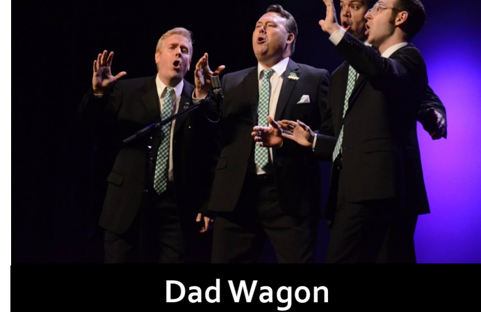
The Summit (Out of District)