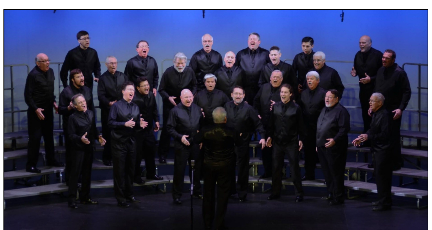
Dixie District Contest

Rounding out the contest were Sound of Tennessee (74.7), Stone Mountain Chorus (70.8), The Big Chicken Chorus (68.6), The Appalachian Express (67.2), Choo Choo Chorus (63.6), Smokyland Sound (63.1), Garden City Chorus of Augusta (62.8), Memphis Men of Harmony (60.6), and Southern Splendor Chorus (58.5). Southern Splendor was the Most Improved Chorus.